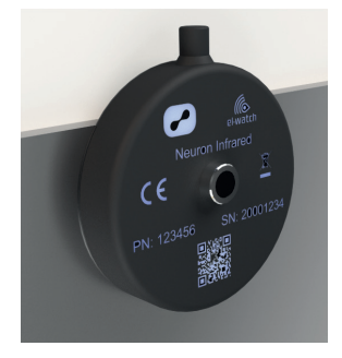
Place elevated with distance to fixed objects

All the black Neuron sensors, like the Neuron IR380 and Neuron Vibration, are fitted with a strong magnet at the back for easy fastening. If there is no magnetic surface, then double-sided tape is a good solution.