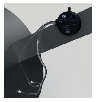
Keep antenna clear off the metallic surface