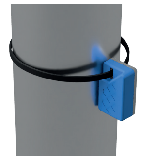
Sensors with IP67 Enclosure