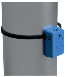
Sensors with IP21 Enclosure